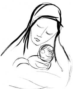
Drawing by Thomas Merton. Used with permission of the Merton Legacy Trust and the Thomas Merton Center at Bellarmine University.

Mother Seton House PO Box 673 Fryeburg, ME 04037